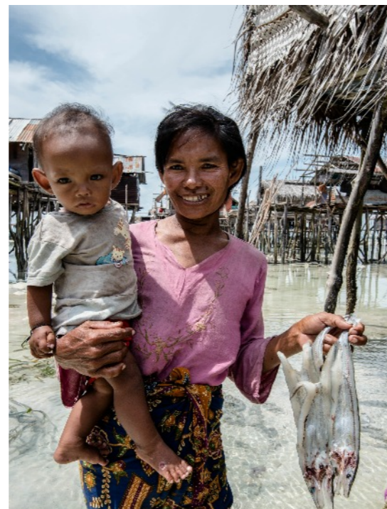
Selakan Island, Borneo

Asia Gateway: www.asiagatewaytraining.net )