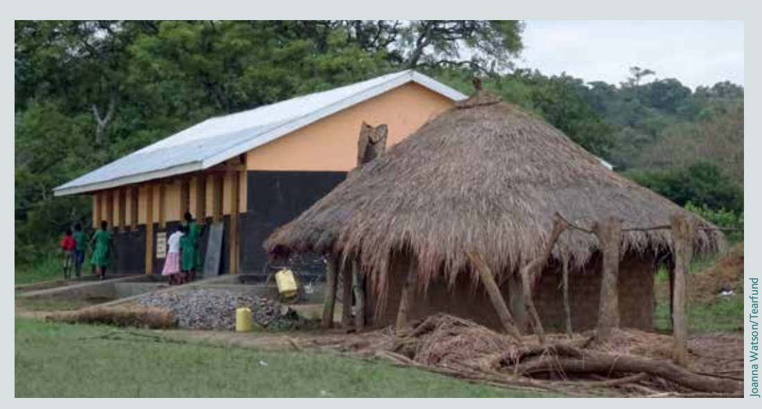
Government classrooms contrast with an old classroom at Owii School in Uganda.