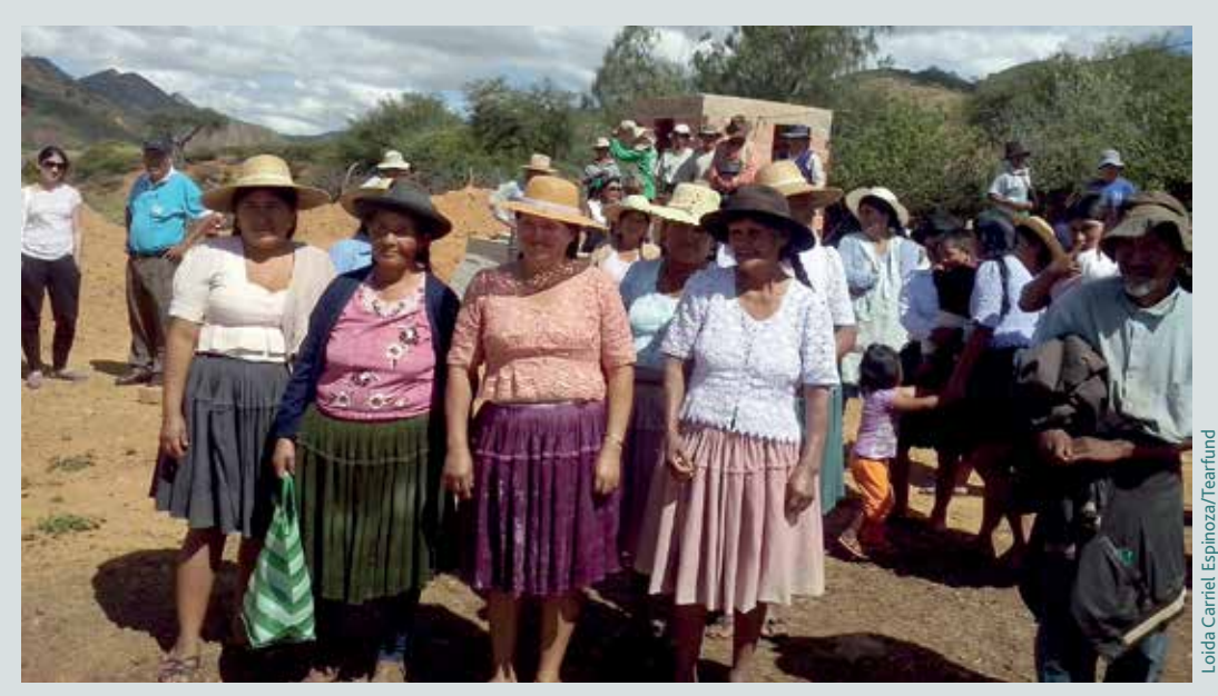
Community members in Tipa Tipa, Bolivia, engaged in CCM advocacy.

A few years ago, Tearfund provided training to UCE in church and community mobilisation, and the local congregation in Tipa Tipa was greatly inspired by the Bible studies. As a result, they realised they needed to reach out to support their community in finding a solution to their water and sanitation needs. Recognising that this was a government service issue, they decided to undertake advocacy to influence the municipal authorities that allocate budgets and provide water and sanitation.