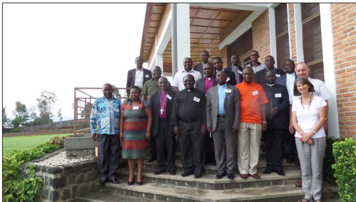
Delegates at Faith2Share's Depth Discipleship Consultation in Goma