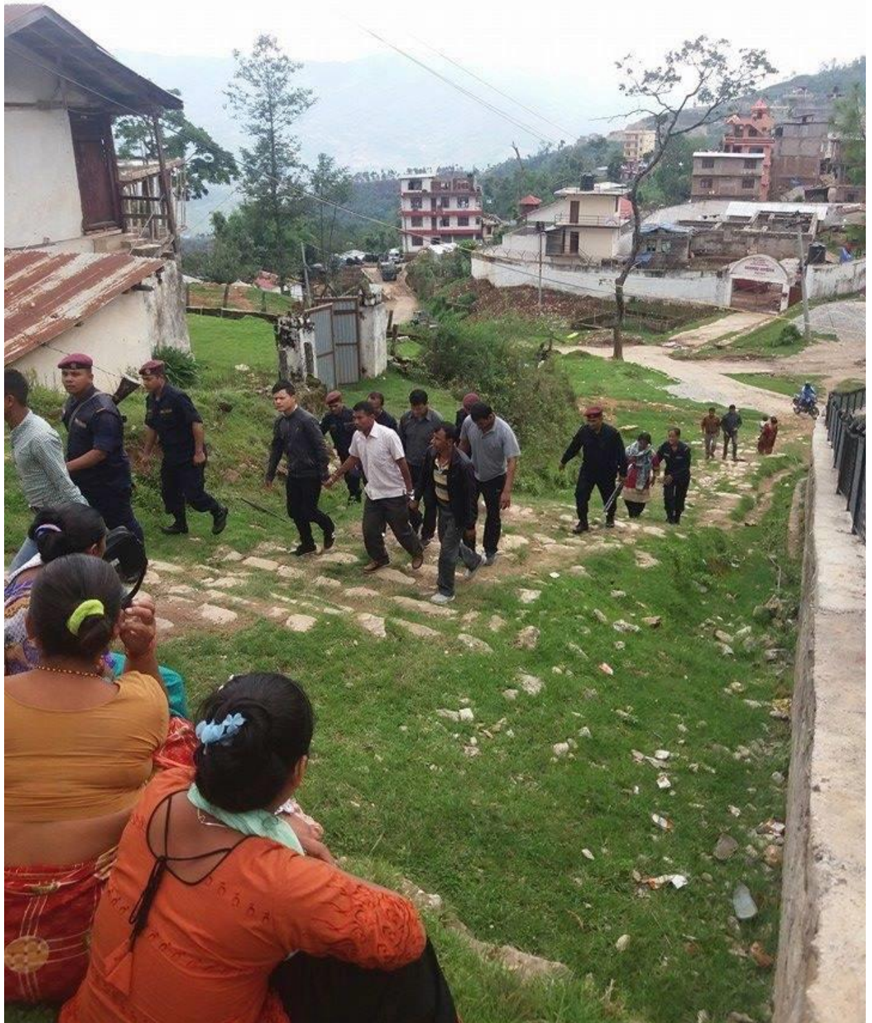
The 7 victims are taken to the police custody as the locals are watching.